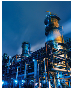
HAZARDOUS LOCATIONS (EX)