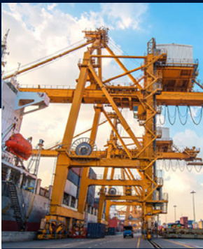
CRANES & LIFTING

Find encoders with the right mechanics, electronics and certifications at leinelinde.com/productfinder